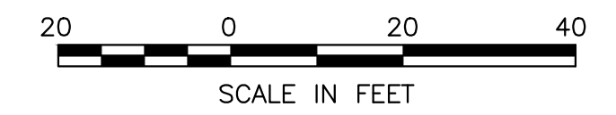
PLAN SCALE 1"=20'